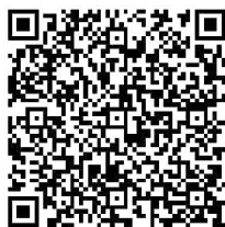
Android (Google Play)